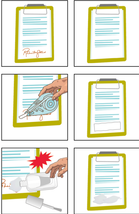
Figure 1: Example images for “she made the signature disappear” with the images shown in order of Baseline, Direct, and Indirect.

An example stimuli is shown in Figure 1, for the statement “she made the signature disappear.” The subject will be asked to select the corresponding cartoon representing the statement. Each image corresponds to a different world state, and the prompt given will correspond to an utterance. Using these, we may recreate the human version of the interpretations for each utterance-world state pair.